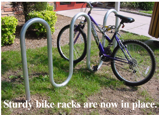
Sturdy bike racks are now in place.