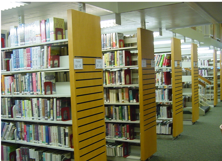
Front panels were updated thanks to your generosity.