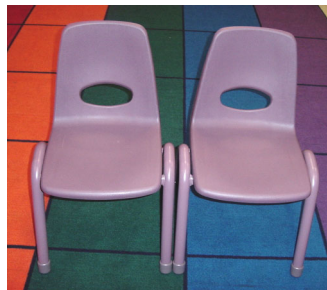
Chairs for the Children's Room.

Commemorative books are still being acquired, but you will soon see more and more of these “dedicated to” bookplates. Over 200 new books were purchased for the Friends’ 50th Anniversary.