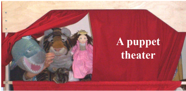
A puppet theater