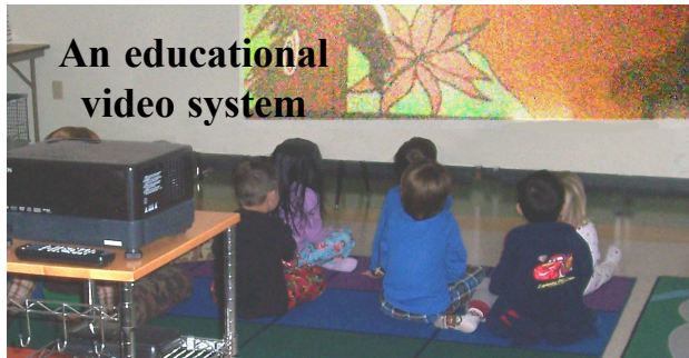
An educational video system